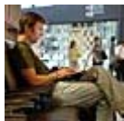
Hacking Airport Wi-Fi