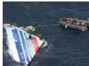
24 bodies recovered from French jet crash