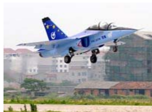
L15-05 trainer plane's maiden flight succeeds