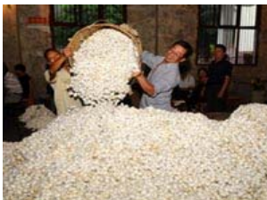
Spring silkworms' cocoons on sale in SW China