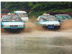
Storms, downpours sweep China, killing at least 50