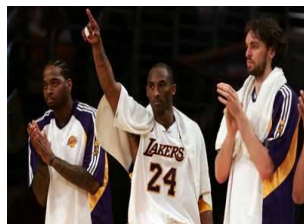
Lakers hang on to beat Magic 101-96 in Game 2